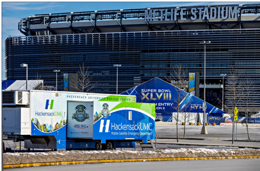
Mobile Satellite Emergency Department (MSED) in Pre-Game (Monday to Friday) location outside MetLife Stadium

MetLife Stadium, part of the Meadowlands Sports Complex in Northern New Jersey, several miles west of New York City recently hosted a major sports event, the National Football League Super Bowl XLVIII. Hackensack University Medical Center (HackensackUMC) in Hackensack, New Jersey, an “official medical services provider” of the Super Bowl, supplemented emergency medical care for event workers and spectators before, during, and after the game.