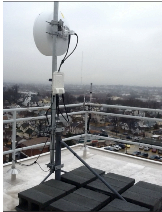
Image of PTP 650 Link, ballast weight temporary mount, roof of HackensackUMC