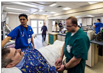
Simulated patient, interior of Mobile Satellite Emergency Department (MSED)