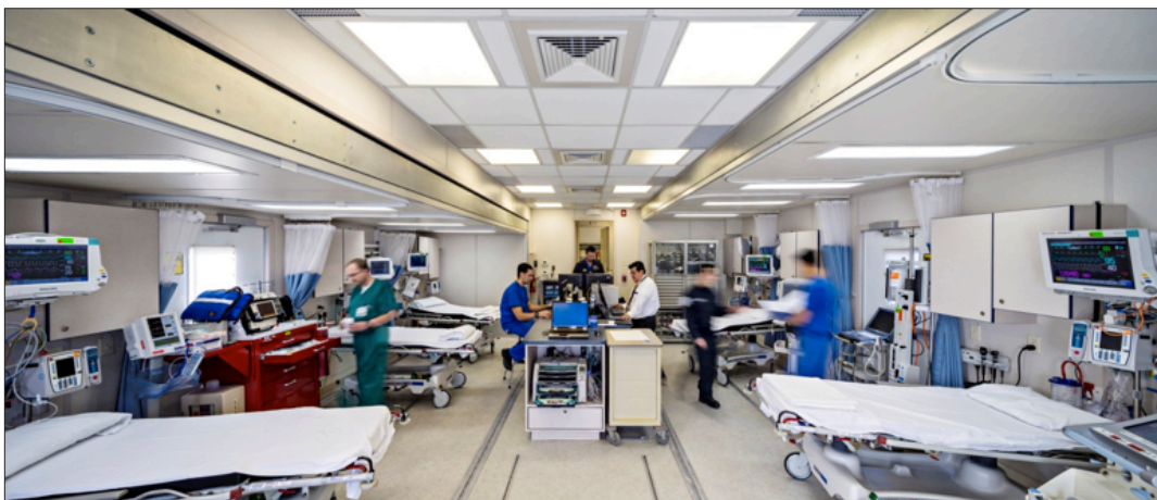
Interior of Mobile Satellite Emergency Department (MSED)

Additional areas for consideration are interfacing with existing point to point microwave links and other wireless networks. Since the PTP series device functions as an Ethernet Bridge, essentially invisible to the network it is serving, computers on the NJ-MSED could function as if they were in any hospital. This would be especially useful if the NJ-MSED were deployed to an area where it was being staffed by medical personnel other than those of HackensackUMC.